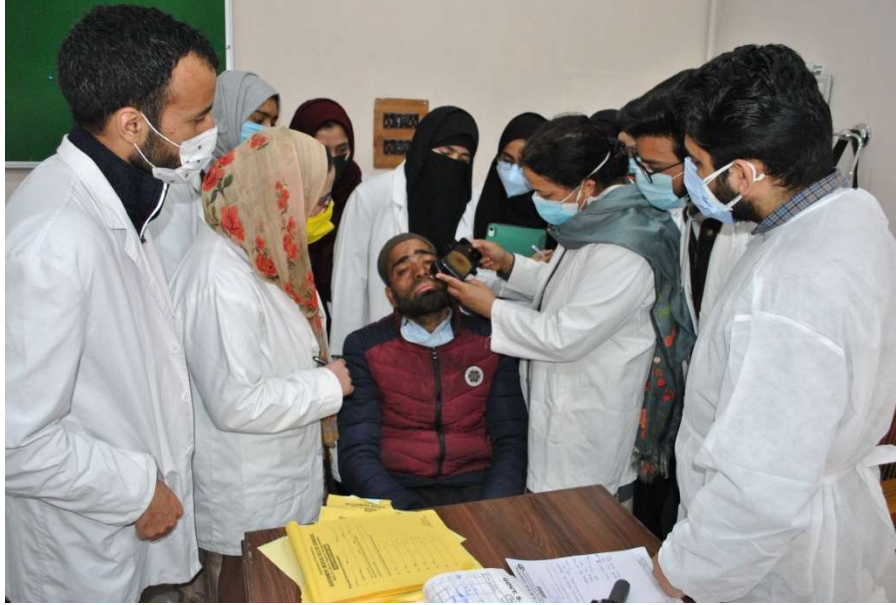
Undergraduate teaching being carried out in the department with latest diagnostic modalities like dermoscopy.