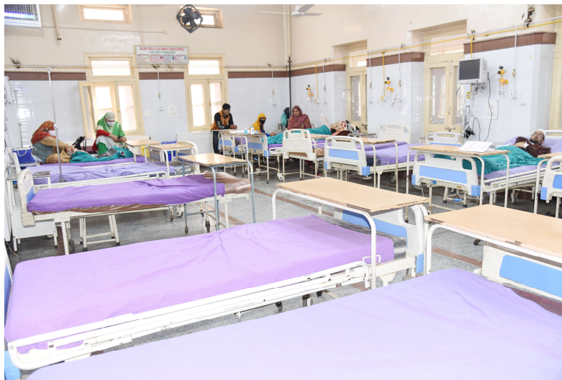
The department has a 30 bedded ward (Ward 4) in SMHS hospital for IPD admissions