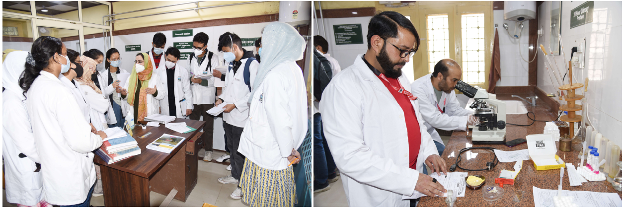
The department has 2 well equipped labs in Block F where various investigations related to Dermatology, Venereology & Leprosy are carried out.