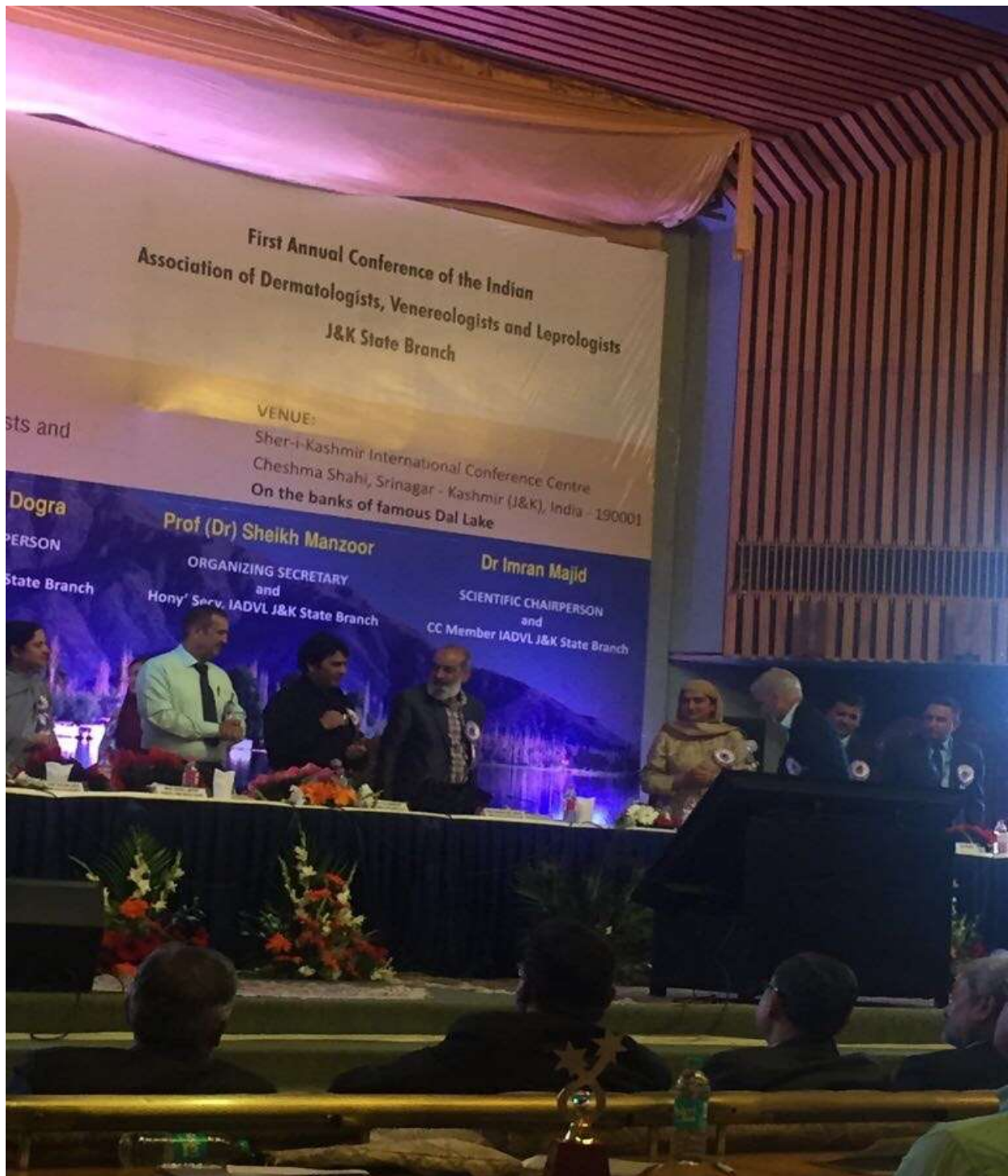
The deptt hosted the 1 st Annual Conference of the Indian Association of Dermatologists, Venereologists and Leprologists J&K State Branch (1 st J&K Cuticon )on 26 th -27 th September 2017.