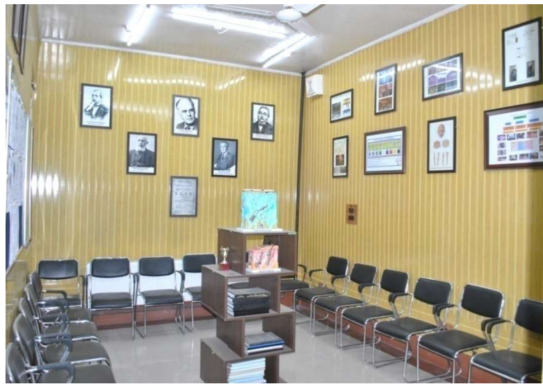
State of the art dermatology museum is present in the department