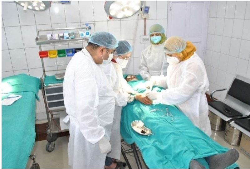
Nail surgery being conducted in the Dermatosurgery theatre