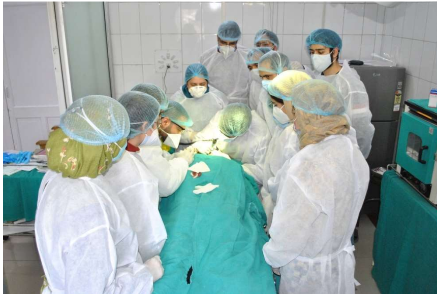
Follicular unit extraction (FUE) hair transplantation is being done in the Dermatosurgery theatre.