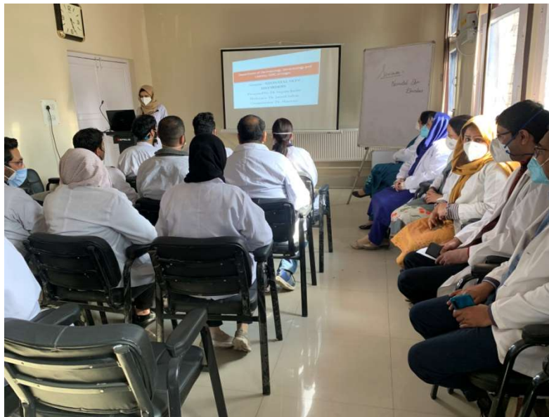
Post graduate teaching being carried out in the departmental seminar room