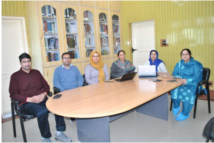
Faculty of the department in the departmental library