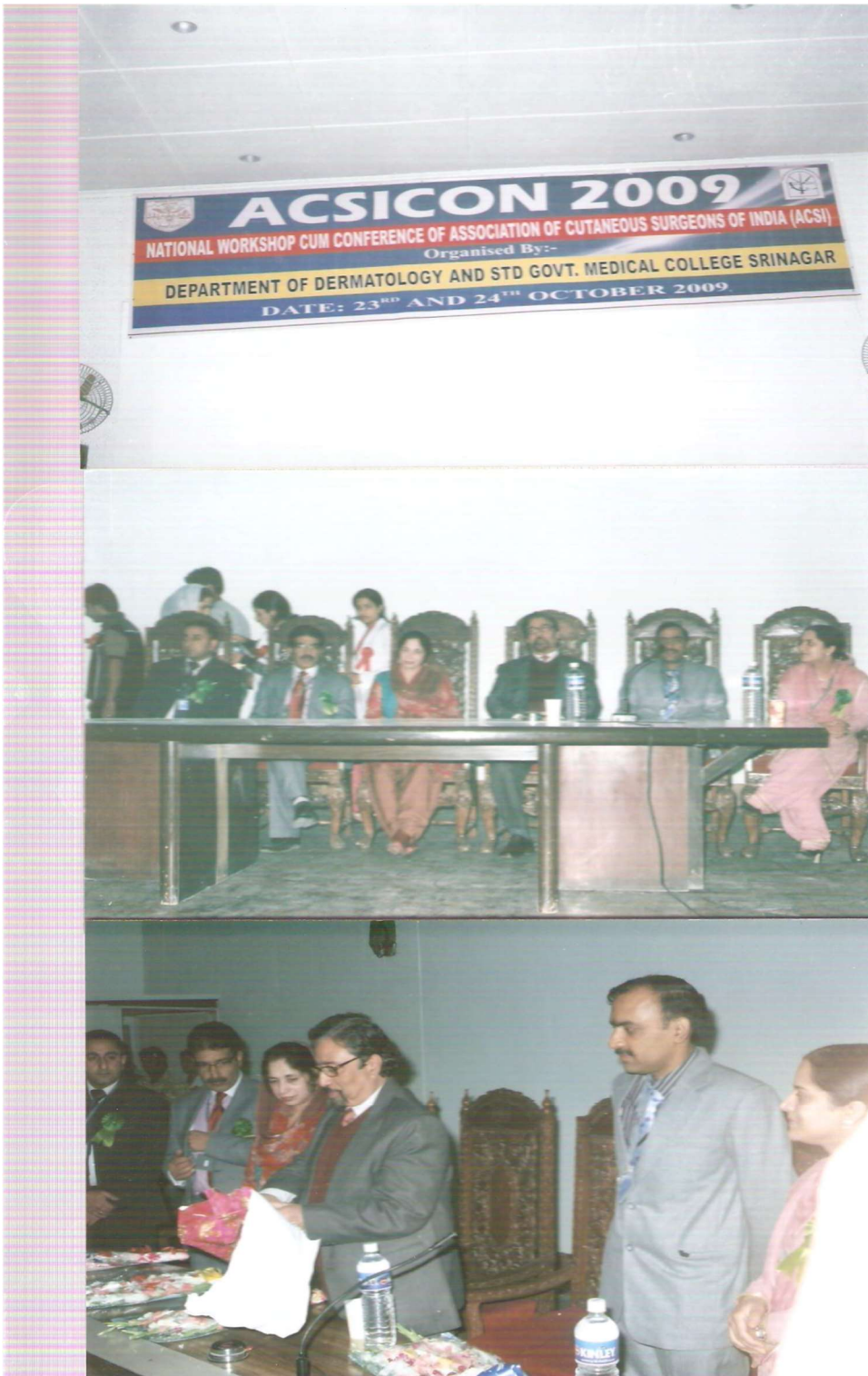
The department hosted ACSICON 2009 (National Workshop cum Conference of the Association of Cutaneous Surgeons of India(ACSI) on 23 rd - 24 th October 2009.