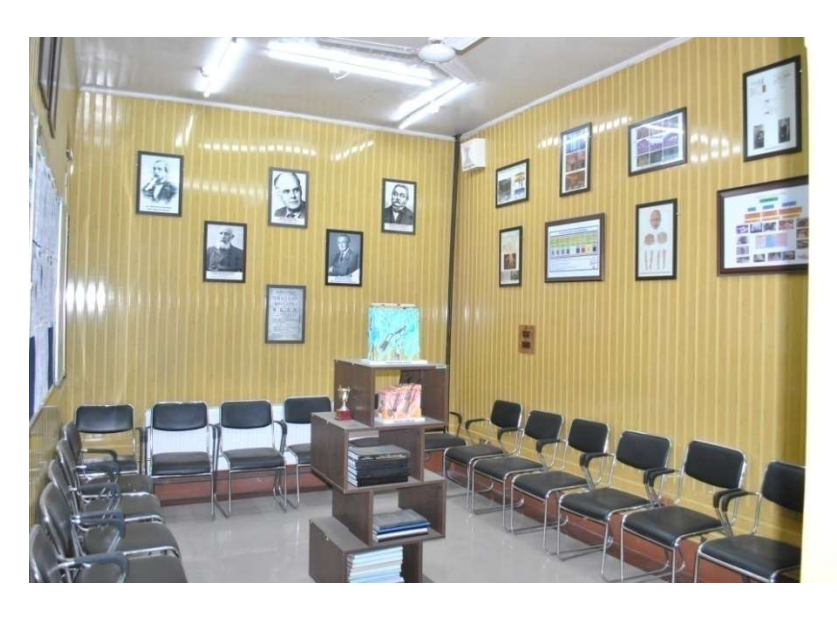
State of the art dermatology museum is present in the department