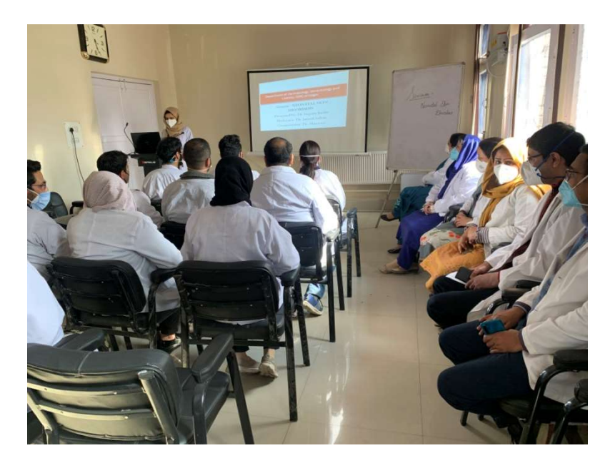
Post graduate teaching being carried out in the departmental seminar room