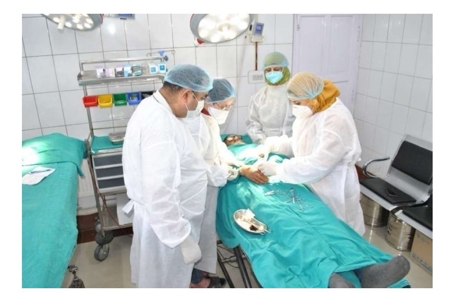
Nail surgery being conducted in the Dermatosurgery theatre