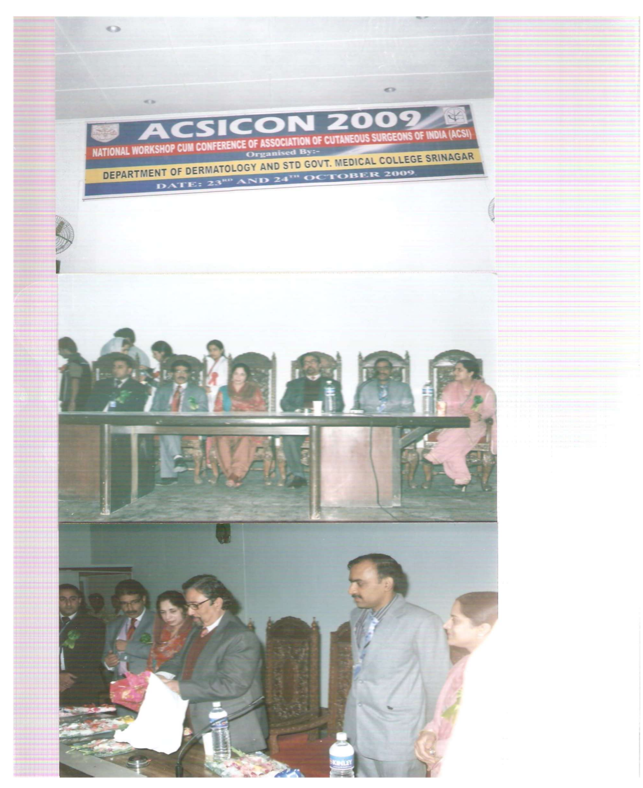
The department hosted ACSICON 2009 (National Workshop cum Conference of the Association of Cutaneous Surgeons of India(ACSI) on 23<sup>rd</sup> - 24<sup>th</sup> October 2009.