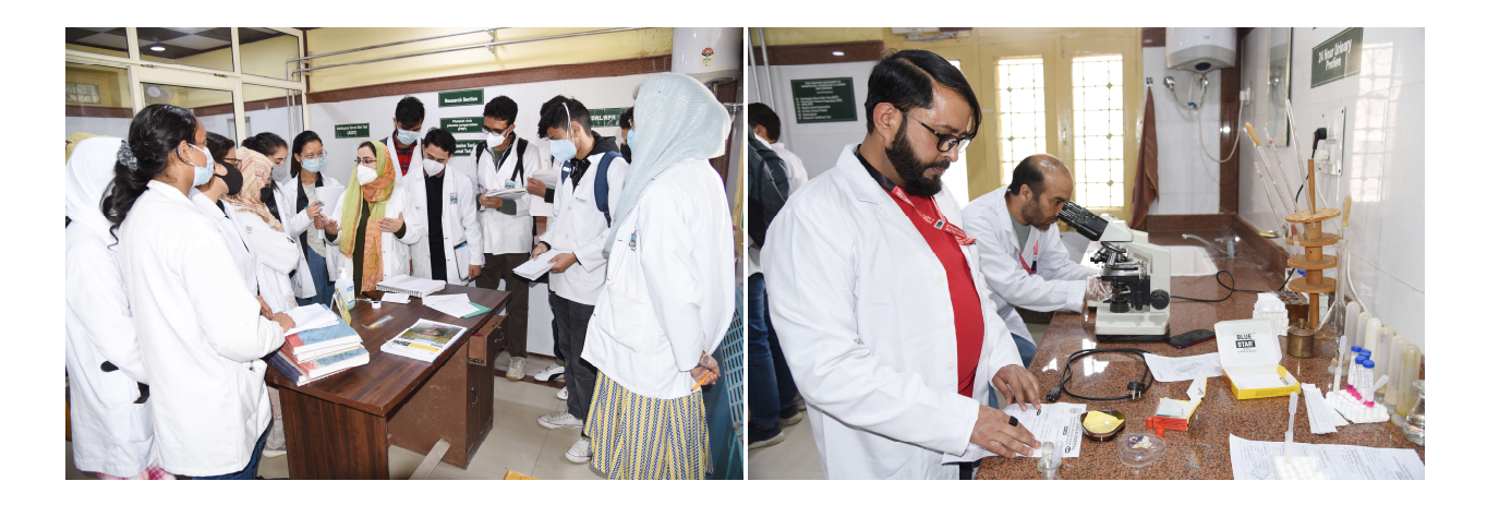
The department has 2 well equipped labs in Block F where various investigations related to Dermatology, Venereology & Leprosy are carried out.